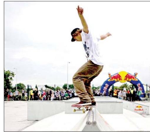
Skateboarding action at the recent Red Bull Local Heroes event in Millennium Park