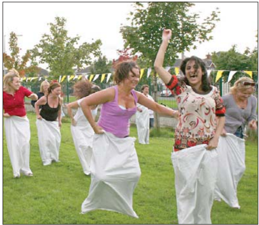
Hazelbury mothers show their skills in the sack race. See story on page 5